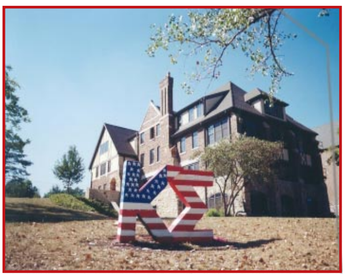
The Undergraduates show their patriotism and support of US troops.

Gamma-Omicron, Inc., is actively seeking alumni members willing to serve on the Board of Directors. At elections next October, we need to fill three existing vacancies as well as three expiring terms on